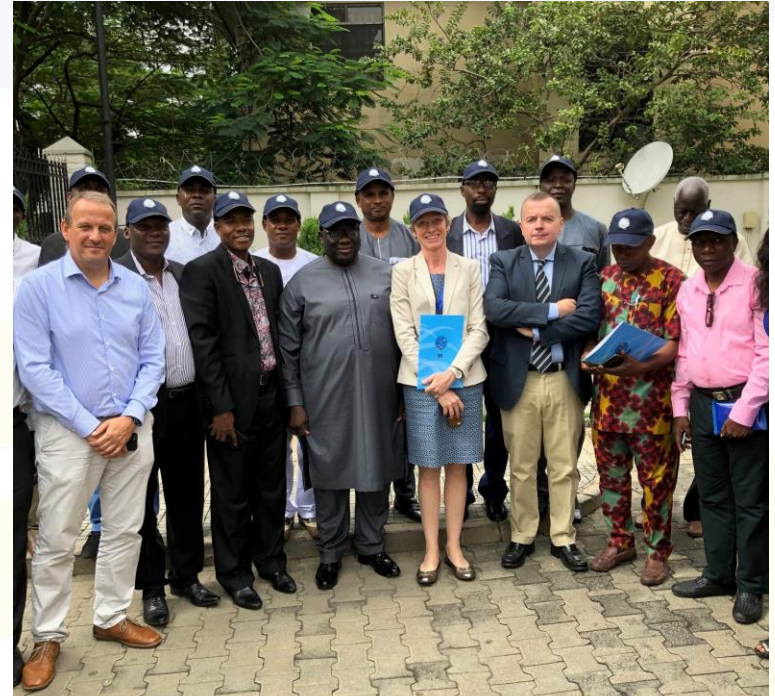
Nigeria training (2-4 October 2019)