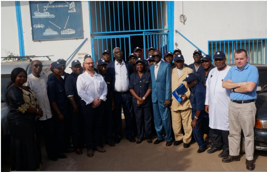
Guinea training on PSMA with FAO (12-14 March 2019)