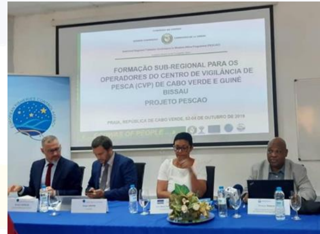
Training session for FMC operators from Cape Verde and Guinea Bissau