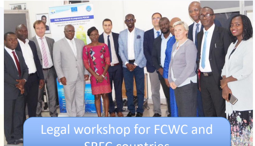
Legal workshop for FCWC and SRFC countries (Dakar, 22-23 May 2019)