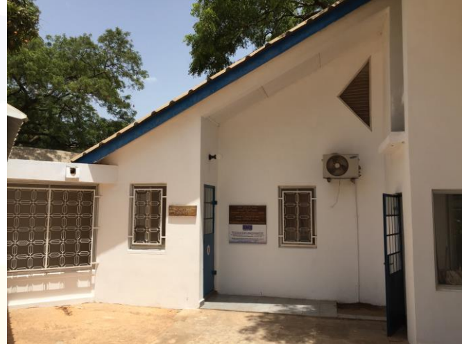
SRFC regional centre (Banjul, Gambia)