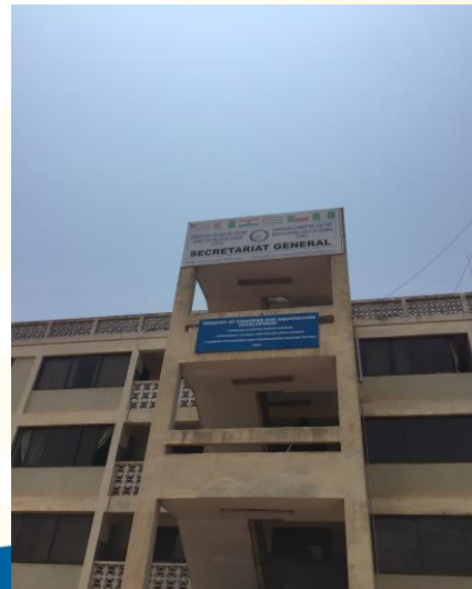
FCWC Secretariat General (Tema, Ghana)